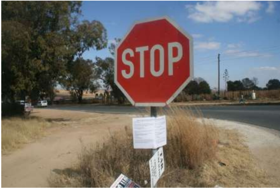
Figure 4: Site Notice at R511 and Mnandi Road