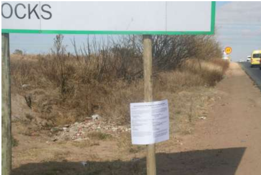
Figure 2: Site notice on R511