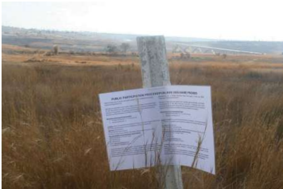
Figure 3: Site notice at Property